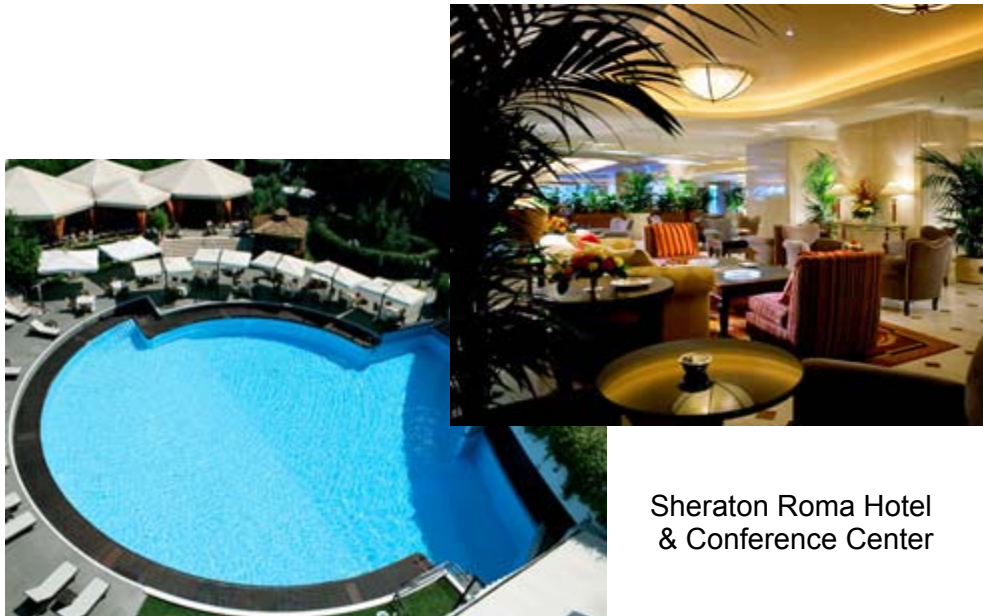
Sheraton Roma Hotel & Conference Center

Please visit www.mascc.org to download a Scholarship Application. Application must be received by February 15, 2009. Written notification will be sent to selected applicants on or before April 30, 2009.